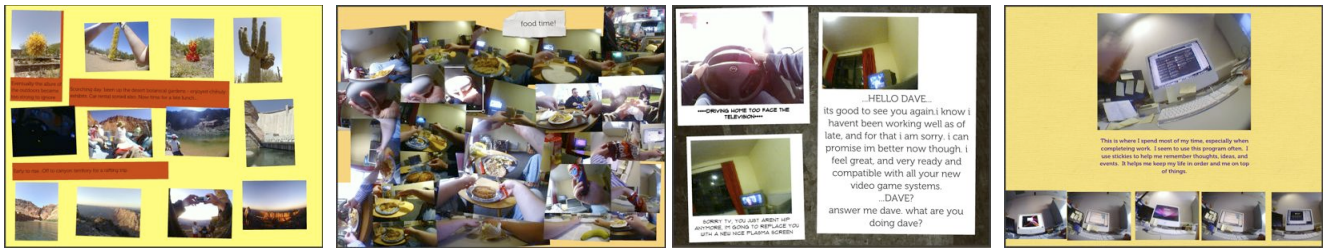
Figure 2. The types of story created. a) Time – A chronology of a single day; b) Biographical - An exploration of observed eating habits; c) Expressive – A fiction layered on the real world content; d) Investigative/Critical - reflections on technology

tough for me to get into because it was almost overwhelming to have such a wealth of information available to you and having to make sense of it and present it in a cohesive and logical way", while another remarked "Never before have I been given the opportunity to look at someone else's life in such detail. It was a bit staggering at first." While students often identified the topic of their story early on, they still experienced challenges in terms of locating content relevant and appropriate to their story: "the only real struggle I had with the project was meticulously scrolling through each day-trying to find the right images I wanted to use with the project."