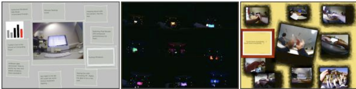
Figure 3. Samples from the case study participant a) What would we do without the web - The center of the universe ; b) Obscure - Colours In The Dark ; c) Awareness I Can See Myself - Busy Hands

But I do feel like I know him after these hours I have spent with him in his car, office and house."