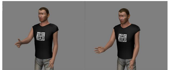
Figure 2. Same input, but different social relation leads to different gestures.

The Action Proposer modules produce the candidate actions based on the current state of relevant aspects of the avatar and its context. Actions produced are indicated as being candidate actions because different modules may propose conflicting actions that have to be resolved in the next step of the framework. The framework has five Action Proposer modules: Dialogue Proposer , Gaze & Attention Behavior Proposer , Adaptive Behavior Proposer , Emotion & Social Behavior Proposer , and Navigation Proposer .