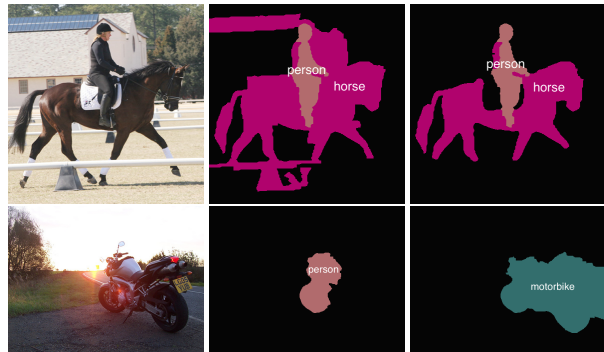
Fig. 1. Examples where a richer spatial codification improves the object segmentation and recognition. Left: images to be semantic segmented. Middle: solution based on a Figure-Ground spatial pooling [6]. Right: solution based on a Figure-Border-Ground spatial pooling.

This work has been developed in the framework of the project BIGGRAPH- TEC2013-43935-R, financed by the Spanish Ministerio de Economía y Competitividad and the European Regional Development Fund (ERDF). Thanks also to FPU-2010 Research Fellowship Program of the Spanish Ministry of Education.