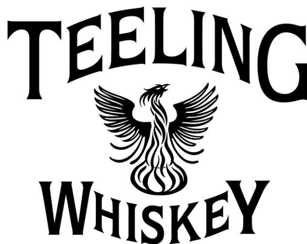
Figure 3. Teeling Whiskey Company Logo.

Since its launch, the whiskey has been awarded numerous accolades including Best Drinks Launch of the Year 2013 at the Drinks International Travel Retail Awards and Gold Medal at the 2013 Spirits Masters. In October 2014, the company released its latest offering, a 23 year old single malt matured in five different wine casks. This cask maturation technique is new to Irish whiskey, making it possibly the most innovative TWC bottling yet.