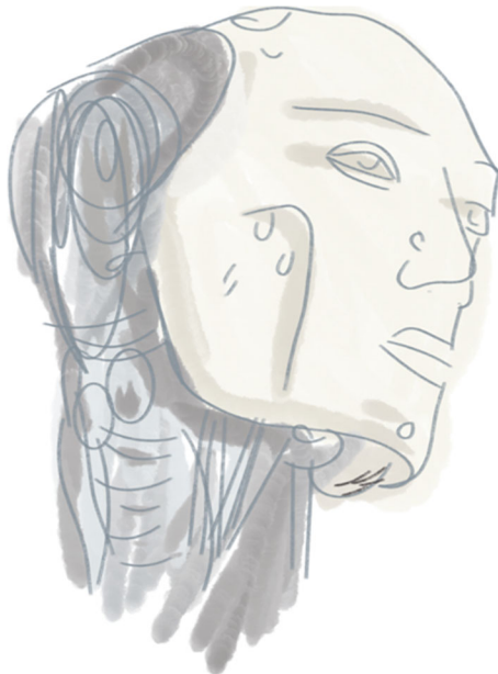
Fig. 3 A ‘datafied’ student as depicted by a former academic

By 2049, the deepmind hive AI historians had detected the fatal flaws that had finally collapsed knowledge production. Even scholars of distant eras had dim ideas that citations were not really correlates of truth but instead a form of virtue signalling and primitive gift giving. What was less understood at the time, although it had been