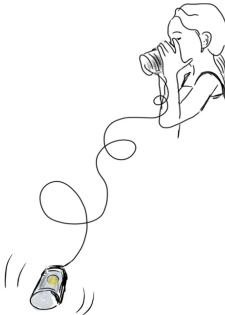
Fig. 2 Humanity isolated from itself