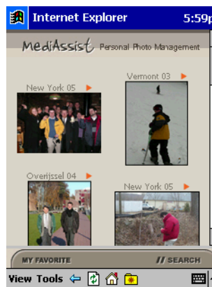
Figure 2. ‘My favorite photos’ with search frame

The mobile interface we present here is twinned with a desktop interface we present in that both provide a web-based interface to the same underlying system but interfaces tailored to the individual requirements for each device. The functionality of the desktop interface (not described here) differs greatly from the mobile interface, though also heavily relies on location.