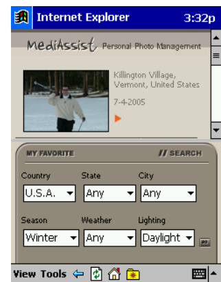
Figure 3. Searching the archive with results as events.