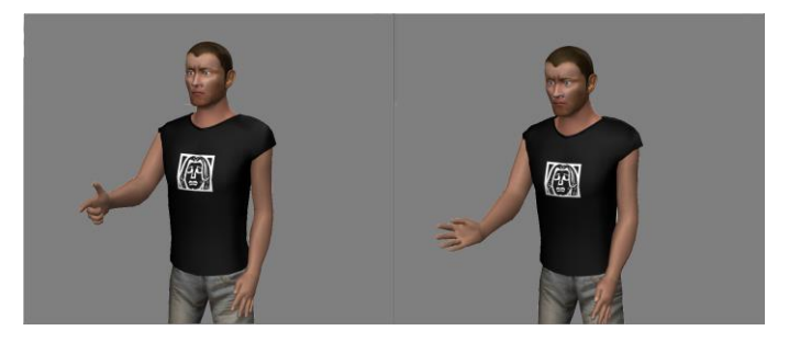
Figure 2. Same input, but different social relation leads to different gestures.

The Action Proposer modules produce the candidate actions based on the current state of relevant aspects of the avatar and its context. Actions produced are indicated as being candidate actions because different modules may propose conflicting actions that have to be resolved in the next step of the framework. The framework has five Action Proposer modules: Dialogue Proposer , Gaze & Attention Behavior Proposer , Adaptive Behavior Proposer , Emotion & Social Behavior Proposer , and Navigation Proposer .