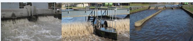
Fig 3. Overview of oxidation ditches at Charleville WWTP

Charleville WWTP was initially designed to take effluent from a nearby industrial plant and its current capacity PE is 15,000 with an agglomeration population of 2,984. Following screening effluent passes through to a splitting chamber, which is divided into two oxidation ditches allowing two separate process streams. This enables each stream to be operated in isolation allowing continuous treatment of wastewater. As there is currently no industrial loading to the WWTP only one stream operates at a given time. In each oxidation ditch 7 m rotors are used to ensure sludge remains suspended at all times. From these ditches the flow passes to two clarifiers to settle the sludge. The sludge phase is passed to a sludge storage blend tank, picket fence thickener and dewatering plant with the sludge removed weekly.