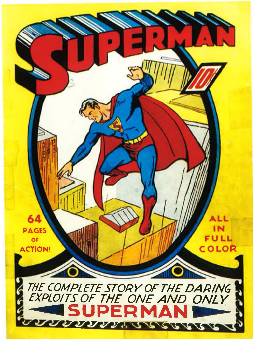
Superman issue 1, written by Jerry Siegel, art by Joe Shuster, published by DC Comics, USA, 1939.