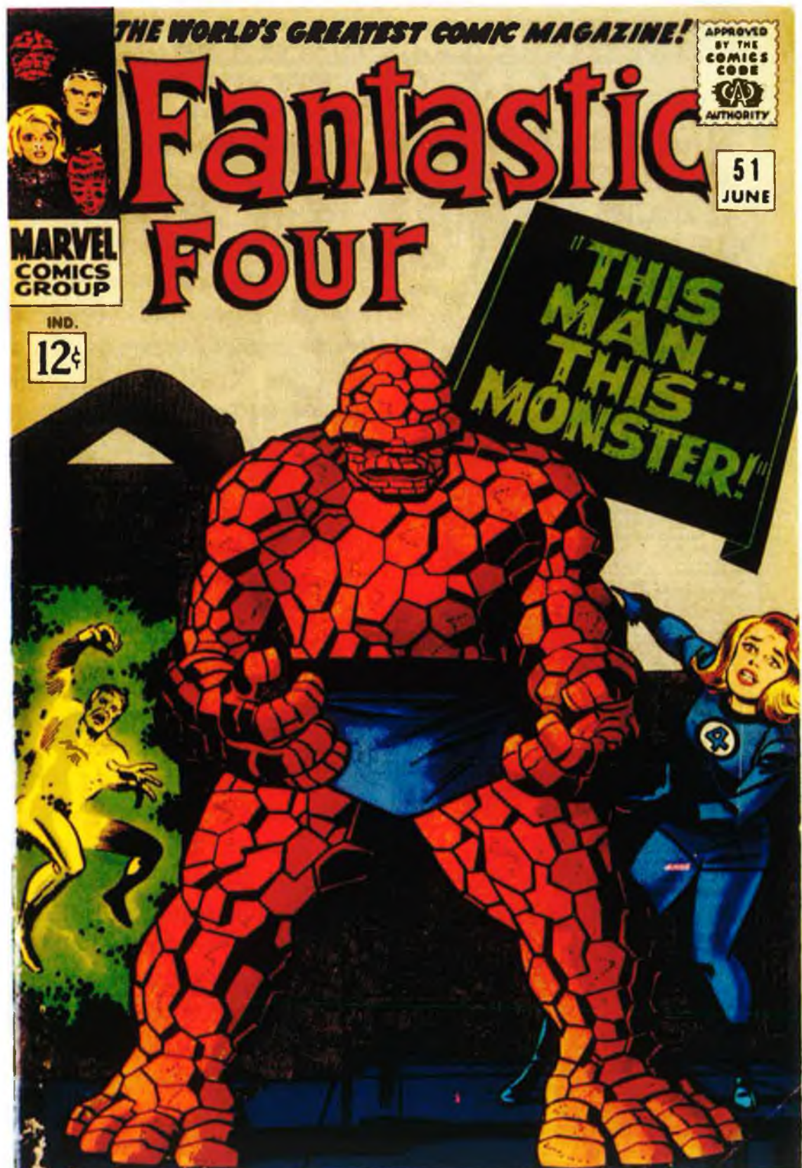
The Fantastic Four, written by Stan Lee, art by Jack Kirby, published by Marvel Comics, USA, 1966.