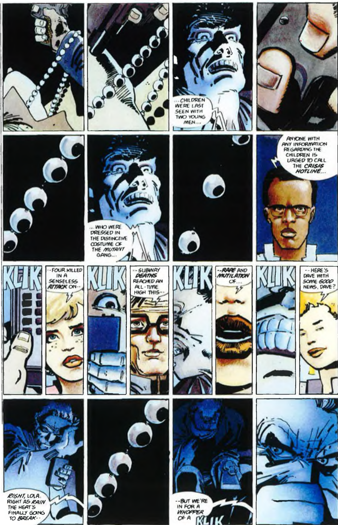
The Dark Knight Returns by Frank Miller, published by DC Comics, 1986.