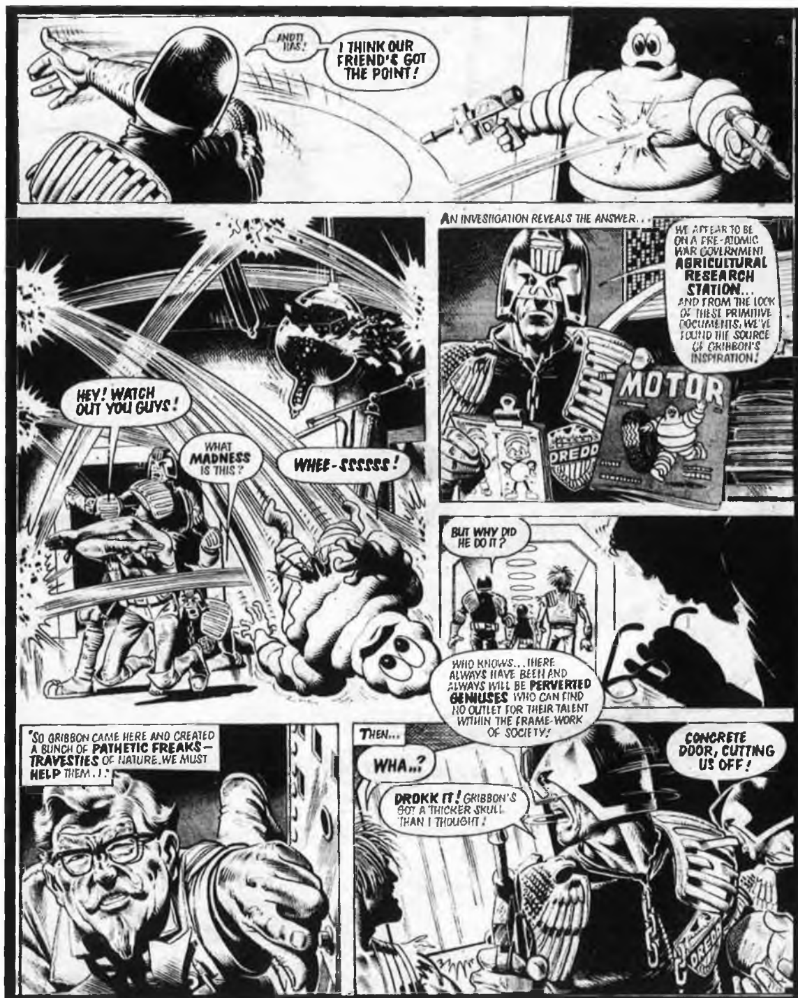
Judge Dredd in an episode of The Cursed Earth from 2000AD prog. 78, published by IPC Magazines Ltd, 1979. Script by Pat Mills, art by Brian Bolland.