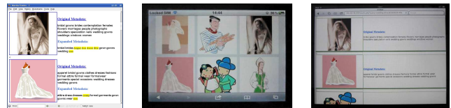
Figure 2: Image search system on a PC (left) and on smartphone and tablet (middle and right).

processing. The image annotation index resides on the server side. Users can try general queries on the system to observe the results for different system settings, e.g. with document expansion or without document expansion. Under the document expansion setting, the expanded annotation terms are displayed with the image results. The demo also includes evaluation results on a Wikipedia image collection for 120 queries. For mean average precision, we obtain 16% improvement compared to a standard retrieval baseline.