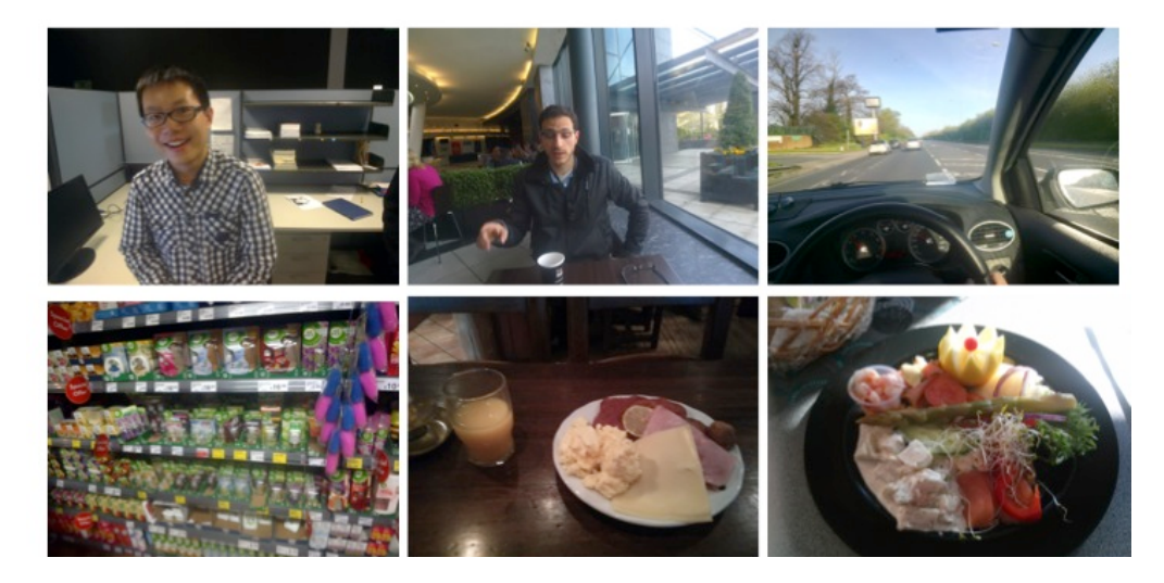
Figure 1. The image outputs of a real-time lifelogging tool running on Google Glass, showing social activities, driving and food-related activities.

However, in these cases there were two important drawbacks. Firstly, the device did not act in real-time, hence it always provided a retrospective review and could never support real-time interventions. Secondly, wearing a phone or a dedicated device such as a SenseCam on a lanyard means that there is significant potential to miss capturing events of interest, which do not by necessity occur directly in front of the wearer. Hence, having a real-time, head-mounted lifelogging platform offers advantages over any of the previously used devices. Integrating SenseCam type functionality (automatic capture of periodic images, coupled with sensor data) into a Google Glass type device results in a new type of lifelogging device, that tracks head movement, but also supports both automatic or triggered capture, along with the potential for real-time interventions. However, in the current pre-release prototype of Google Glass, battery-power restricts the usage to periods of a few hours at a time. In Figure 1, we show the types of photos that can be captured using a Google Glass device.