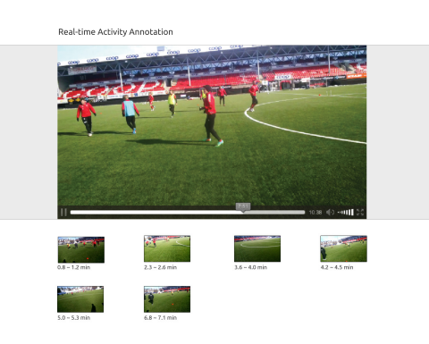
Fig. 1: The platform web interface

The major contribution of our work presented in this paper is combining the Google Glass, a state of the art hardware, with event detection techniques for real-time annotation, which can be used for many real-world applications. Taking the specialty of Google Glass into consideration, a region importance mask is created to reduce noisy information in the event detection. An event detector built on the combination of edgeness and color moment features is proposed and has shown very promising detection performance.