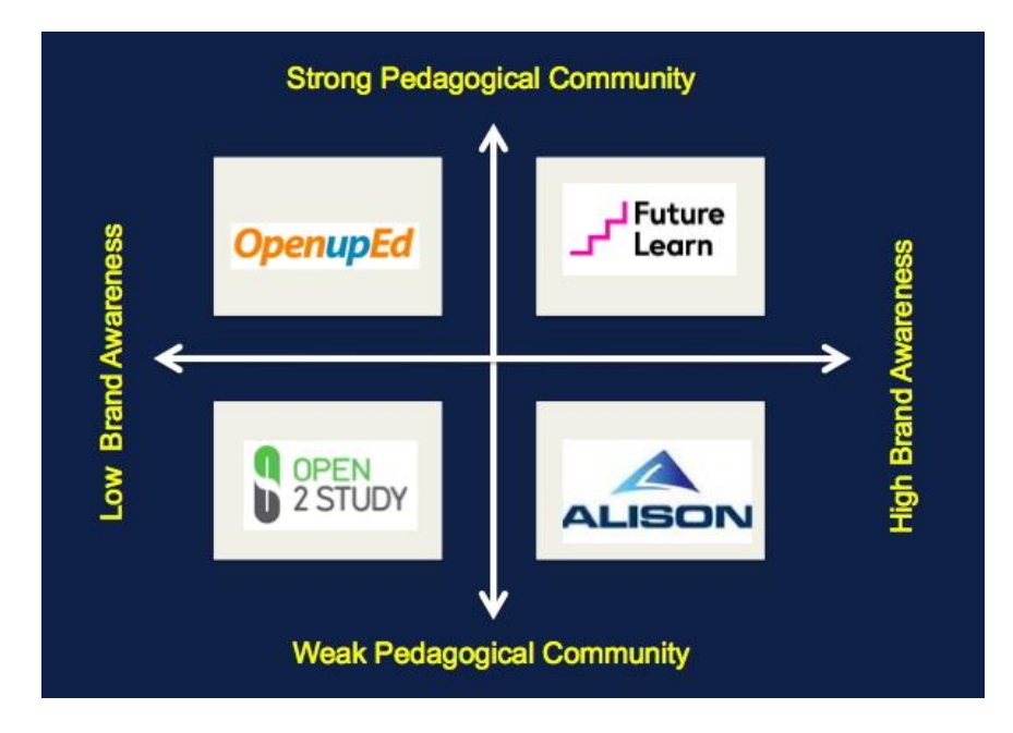
Figure 3: Example decision plot

In a similar vein, we have generated valuable dialogue and matured our thinking by plotting different MOOC options on a chart in order to highlight key differences where the x and y axis represent specific variables. For example, Figure 3 depicts the differences we perceive between four different MOOC options according to brand awareness (x) and strength of pedagogical community (y). The figure below shows FutureLearn in the most desirable top right quadrant with both high brand awareness and a strong pedagogical community supporting future development. Of course, this assessment reflects a European bias as FutureLearn has yet to establish a major foothold in North America. In the case of Open2Study, the bottom left quadrant reflects the fact that this MOOC is very much an Australasian initiative but the position could change in the future. Importantly, the relative position of the MOOC platforms changes depending on the variables, especially if you select the cost of the option compared to brand awareness or the ability to make local customisations compared to the strength of the pedagogical community.