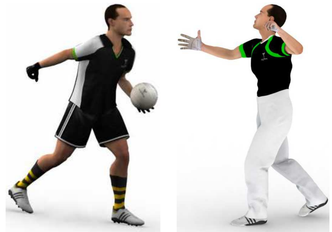
Figure 2: Pictures taken from our live demo, a Gaelic (left) and a Basque player (right).