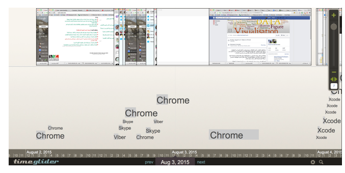
Apps & Screenshots Timeline

LoggerMan organises the screenshots and the app usage data in a zoomable timeline to provide a dyanmic and up-to-date view of computer usage.