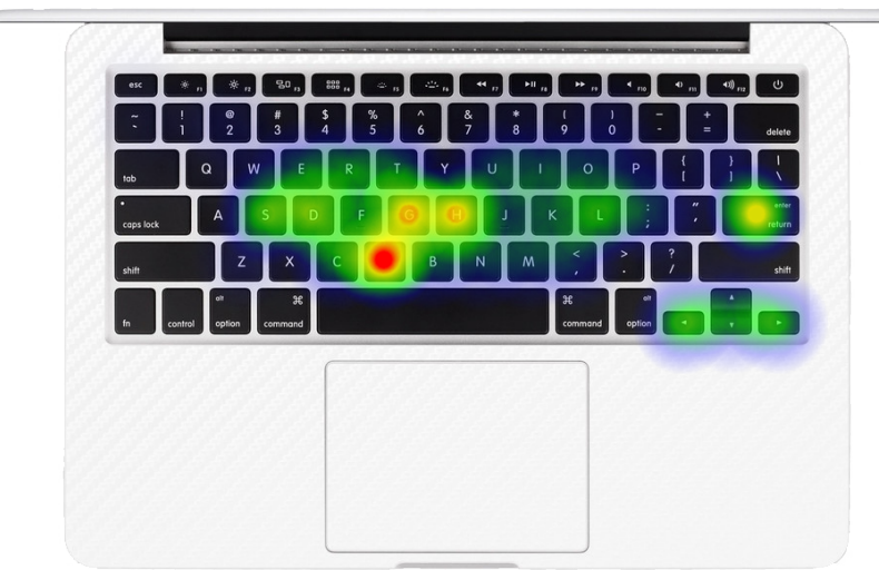
Keystrokes Heat Map

The most used keys during a date range are also visualised as a heatmap.