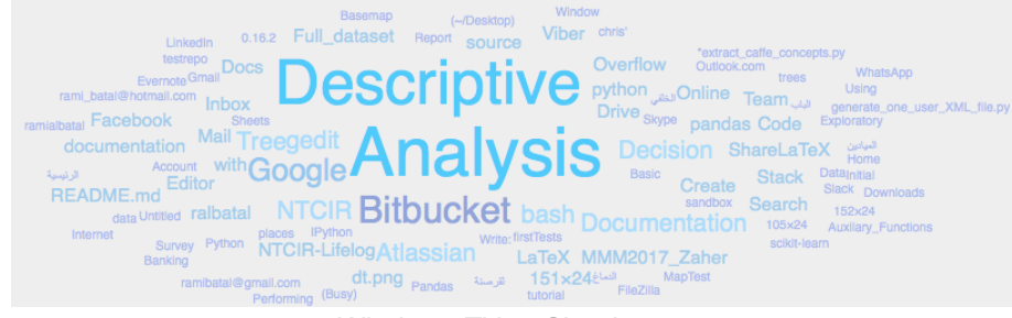
Windows Titles Cloud

Information about mouse clicks and typed keystrokes during a time frame is also presented as a graph.