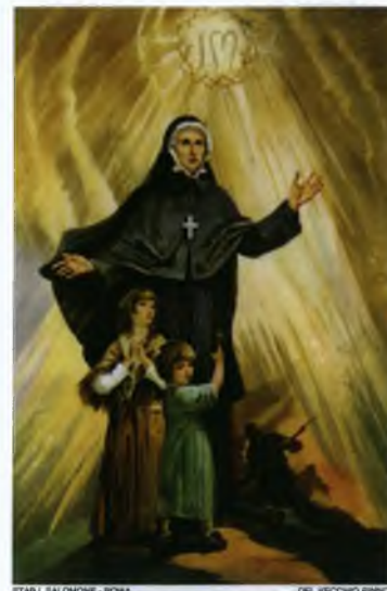
DEL VECCHIO PRINT SAINT CLAUDINE TH VENET (MARY ST. IGNATIUS) FOUNDERESS OF THE CONGREGATION OF THE RELIGIOUS OF JESUS AND MARY

The Jesus and Mary Educational Communities recognise that young people are the hope of tomorrow and a powerful force for renewal in the Church and in the World.