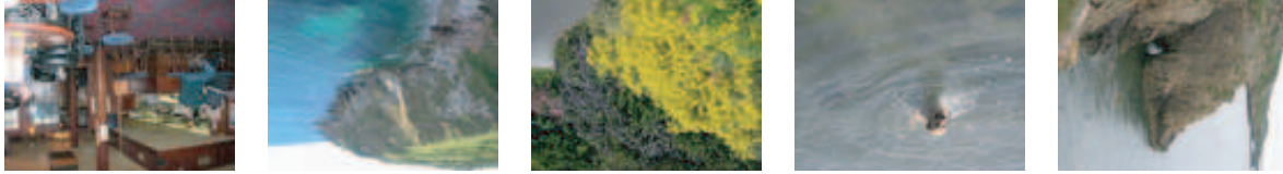
Fig. 2. Examples of failures of our method (KNN. K=5 - \gamma = 1/2 ). Image were originally naturally oriented. They are shown in the detected orientation

the other hand, when the pre-classified class is used alone ( \gamma = 0 ), the results drop to 73% with a 5-NN classifier. Some examples of where the approach fails are illustrated in Figure 2, and some typically correspond to images for which even humans would have difficulty in determining orientation.