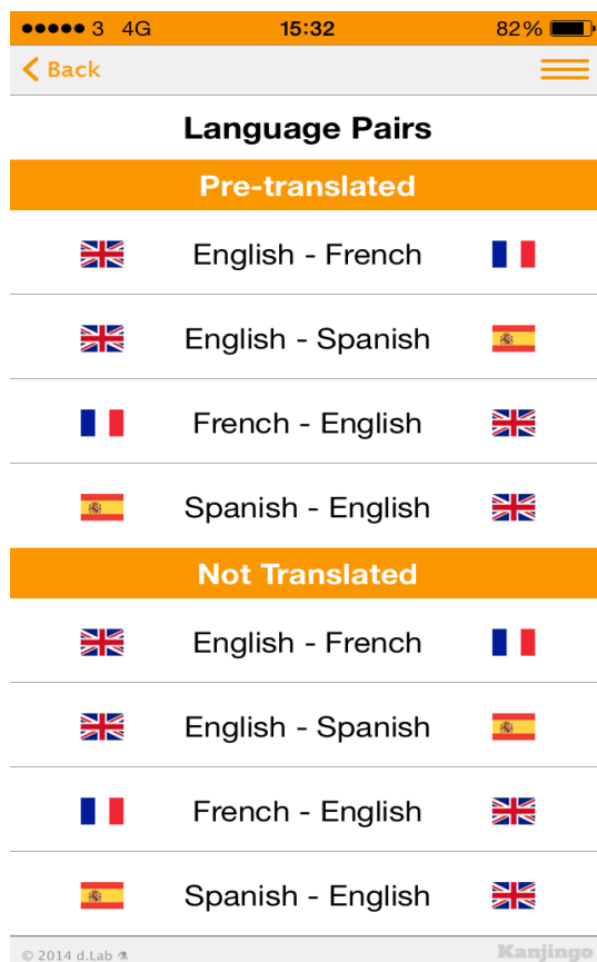
Fig. 1: Choice of language pairs

The current version of Kanjingo is built for iPhone. Once the user has logged in, they are given a choice of language pairs as shown in Figure 1. Thereafter, the user is presented with a list of segments in the chosen language pair. Clicking on a segment will bring the user to the editor view (see Figure 2). Within this view, the target text as produced by machine translation is presented on vertically aligned tiles. The user may click and drag each word tile to change word order, delete words by clicking the red '-' button, or add words using the blue '+' button. Words may be added using the keyboard or the iPhone-native automatic speech recognition function. The source segment is always visible at the top of the screen, and the full target segment is available by scrolling to the end of the word tiles.