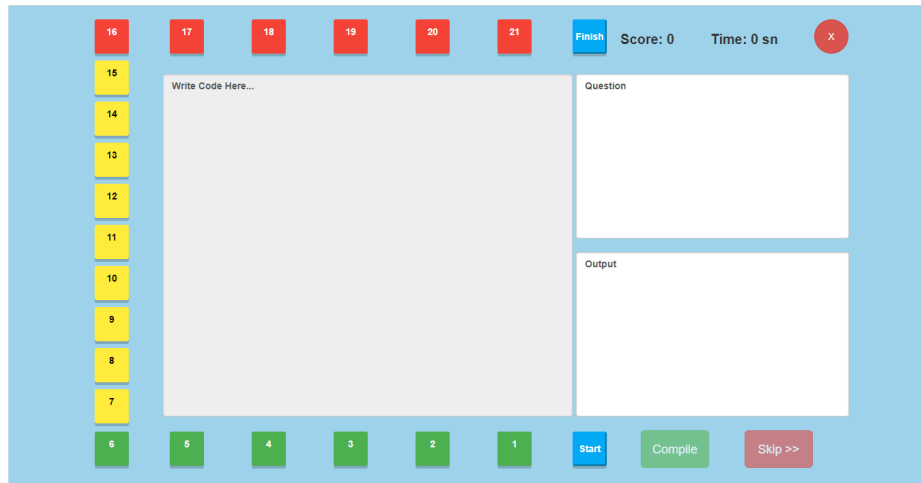
Fig. 2: Race-Course of On-line Version of CENGO