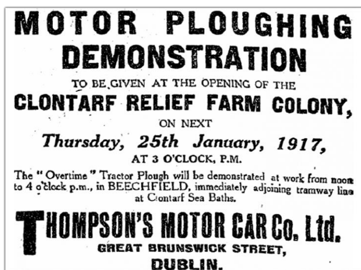
Fig (ii) Advertisement for motor ploughing demonstration at opening of Clontarf relief farm colony, Irish Times, 23 Jan. 1917.

Motor tractors were not only a rare sight in Clontarf: two of the then 70 or so tractors in the entire country were ploughing the glebe field in Clontarf on the afternoon of the last Thursday in January 1917. 10 Advertisements in national newspapers, such as that shown in figure (ii) were used to publicise the