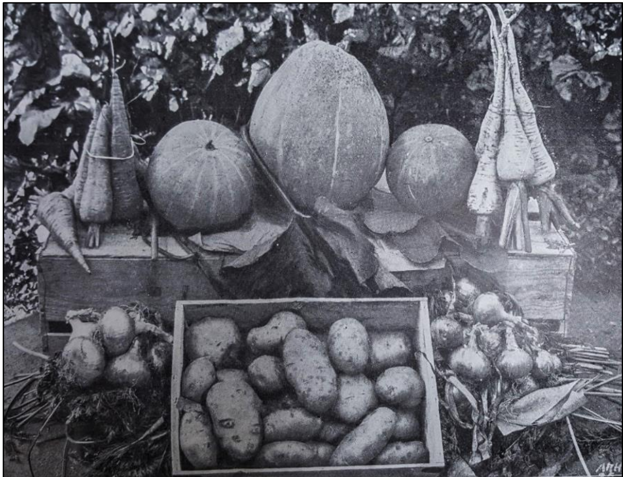
Fig (i) Vegetables grown by 'an amateur on a plot which had previously been a tipping ground', [ DATI Journal Vol XVII , (Dublin, 1917), p. 428

While it is possible to research both allotment locations down to the level of an individual field in some cases, it is extremely difficult to research the community of people associated