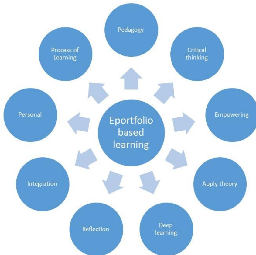
Figure 1: My conception of eportfolio based learning