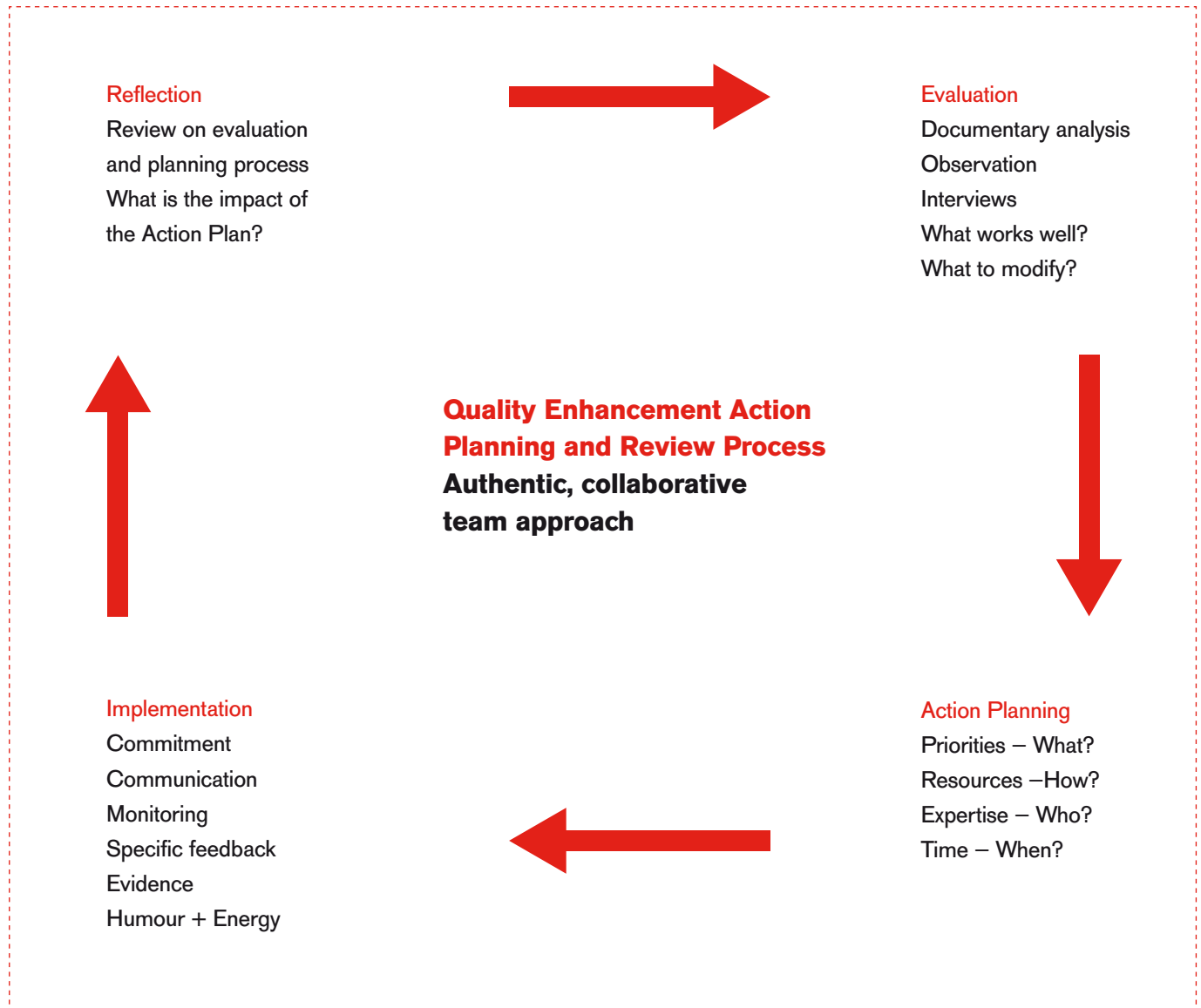
Figure 2 The quality enhancement action planning and review process

Effective implementation involves change being understood by leaders as a people-oriented process, through maintaining staff self esteem, providing positive feedback on staff's implementation and continual review to evaluate the effects of the change to make adjustments. Early childhood leaders must demonstrate the incentive to overcome challenges, to offset sources of resistance and to activate both external and internal resources to support change. The following diagram demonstrates the process of review based on the writings of Pascal and Bertram (1994) and adapted from CECDE (2007).