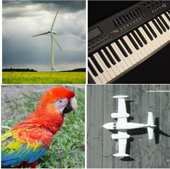
Fig. 1. Examples of four target images used in the NAILS experiment.

data gathering and use of the data from a RSVP-EEG BCI, could enable other researchers to leverage a RSVP-EEG BCI as a component to drive other applications within the multimedia modelling space although the intended application may not be specifically for image labelling.