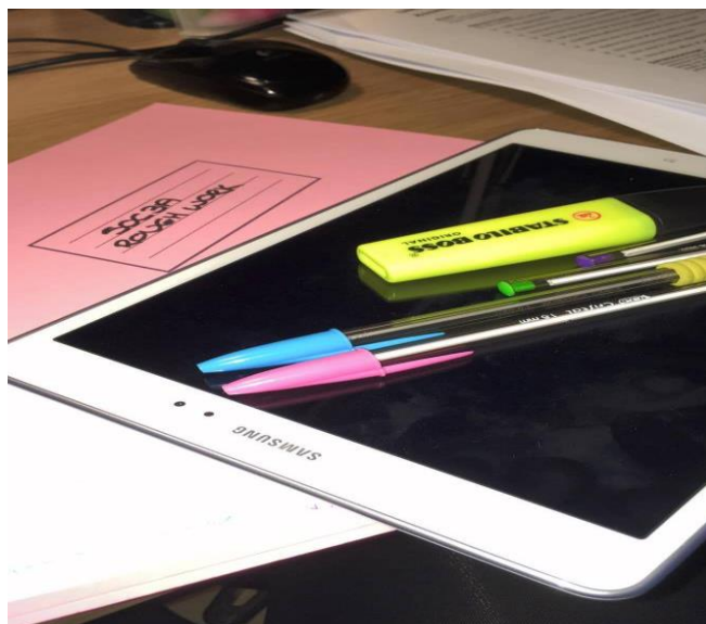
Figure 3. Participant study space