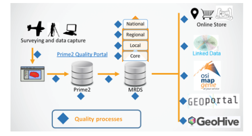
Fig. 1. OSi Geospatial Data Publishing Pipeline with Quality Control Points

lifecycle". The objective of the Elite-S Marie Sklodowska-Curie Cofund Action LinkedDataOps project<sup>2</sup> is to meet dynamic quality needs by providing new continuous data quality tools and methodologies.