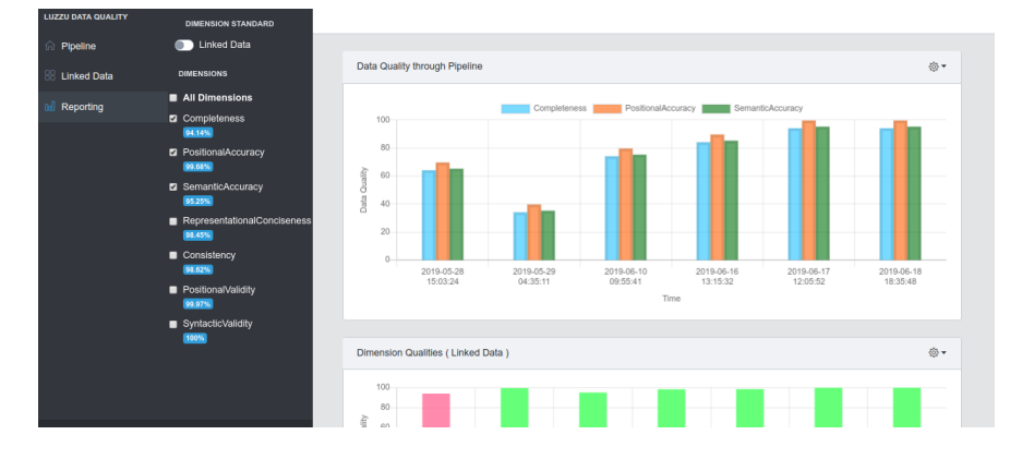
Fig. 3. OSi End-to-End Dashboard Reporting

for specific datasets (associated with stages or systems within the pipeline) iii) historical quality changes over time (illustrated in Fig. 3) iv) pass/fail quality status of a specific dataset for a given quality threshold, for example w.r.t the different standardization approaches.