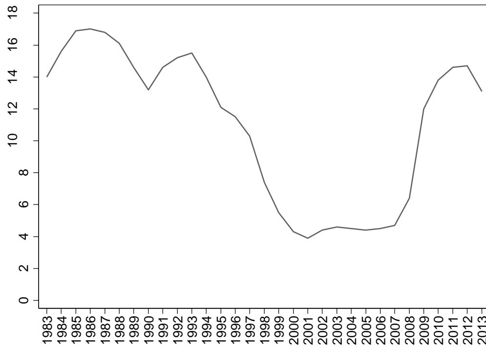
Figure 1. Standardised unemployment rate 1983-2013