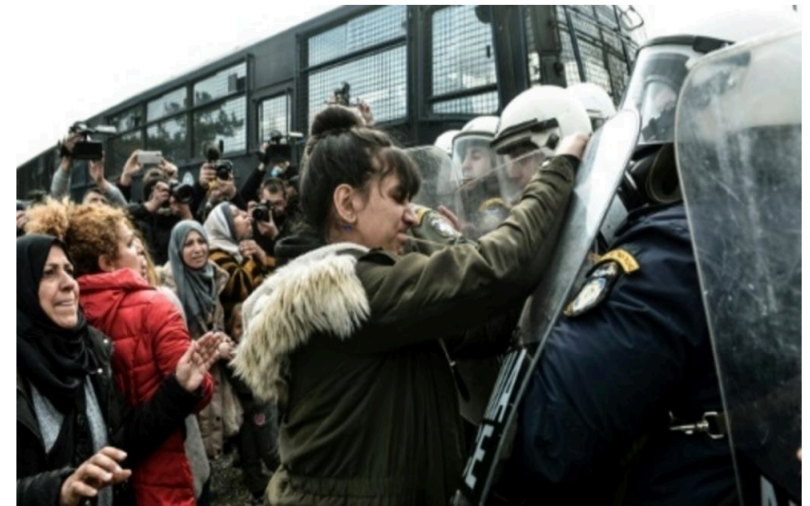
Clashes broke out in a migrant camp in Diavata in northern Greece