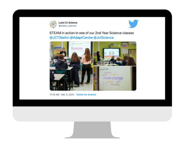
Tweet demonstrating how one of the teachers who participated in the workshop integrated the material in their Junior Cycle Science lessons, March 2020

Feedback from the workshops revealed the significant extent of teachers' interest in AI, ethics and responsible research and innovation. The workshop material was relevant to a wide variety of teachers and subject areas. Part of the success of the workshop is that it did not just attract participants from traditional STEM subjects. An interdisciplinary spread of attendees from different subject areas (e.g. Religious Education and Home Economics) approach discussion topics from different perspectives depending on their subject areas. Such interdisciplinary representation reflects the diversity of subject expertise in ADAPT, and across society as a whole, where we observe that research and interest in AI ethics and privacy is wide-ranging. That teachers from diverse subject areas are considering AI and its societal challenges and implications is very promising for the future pipeline of AI students and researchers.