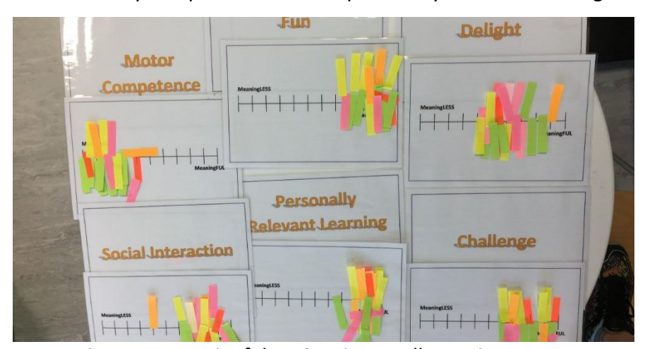
Figure 1: Meaningful PE Continuum Illustration

Following a scavenger hunt activity, PSTs completed a chart (Fig.1) whereby PSTs placed a sticker along a continuum to identify how meaningful they found the activity. It is clear from the picture that the PSTs found motor competence to contribute less to the meaningfulness in this activity compared to fun and personally relevant learning.