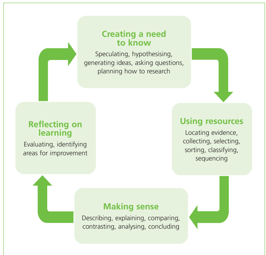
Figure 1: A framework for enquiry in geography education.