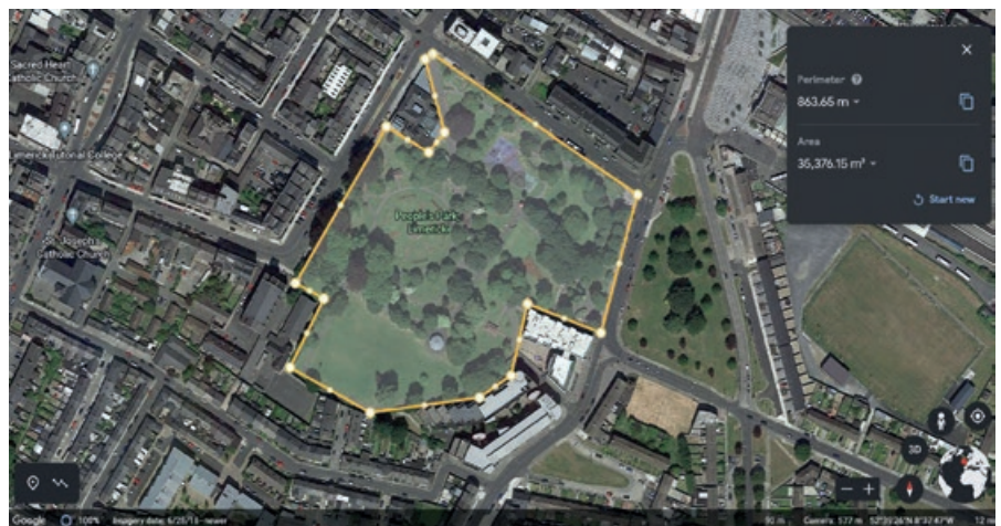
Figure 3: Pupils can use Google Earth to identify and measure the area of their local park and key features in order to make a scale model in Minecraft EE.

Using Minecraft EE (Figure 4) groups can work together from different laptops and locations while building the same public park.