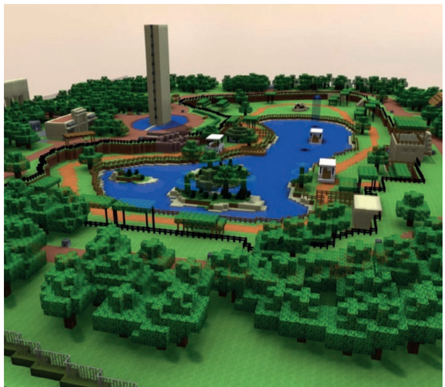
Figure 4: An example of a redesigned public park built collaboratively by pupils using Minecraft EE.