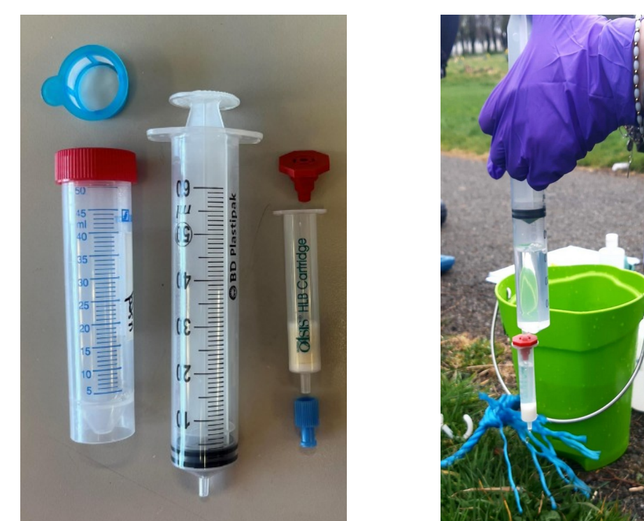
Figure 1 – Components of the CSHydro kit (L) and field trial (R)