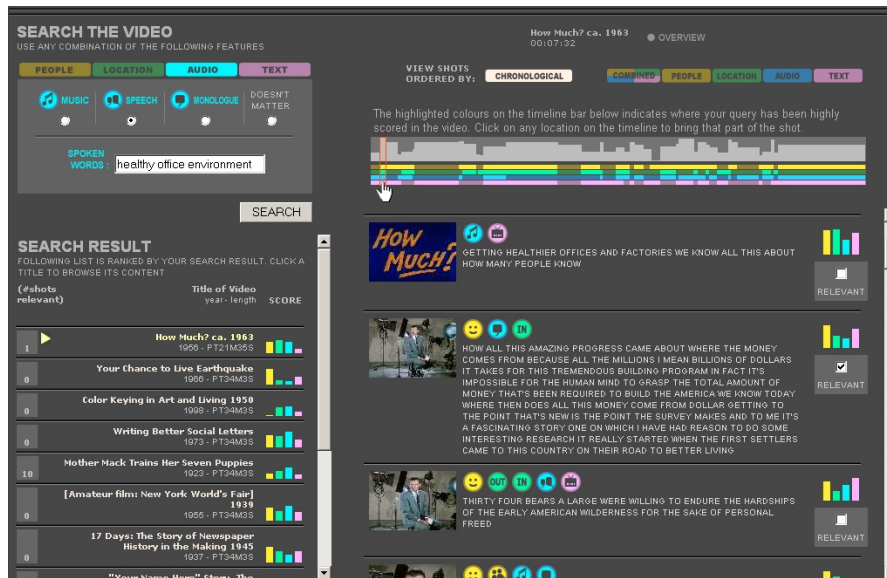
Figure 5.1: Searching interface of Físchlár-TREC2002

etc. This system (Lee et al. , 2002) is an example of one which allows the user to use automatically-derived video features, marked up in MPEG-7, as part of shot retrieval.