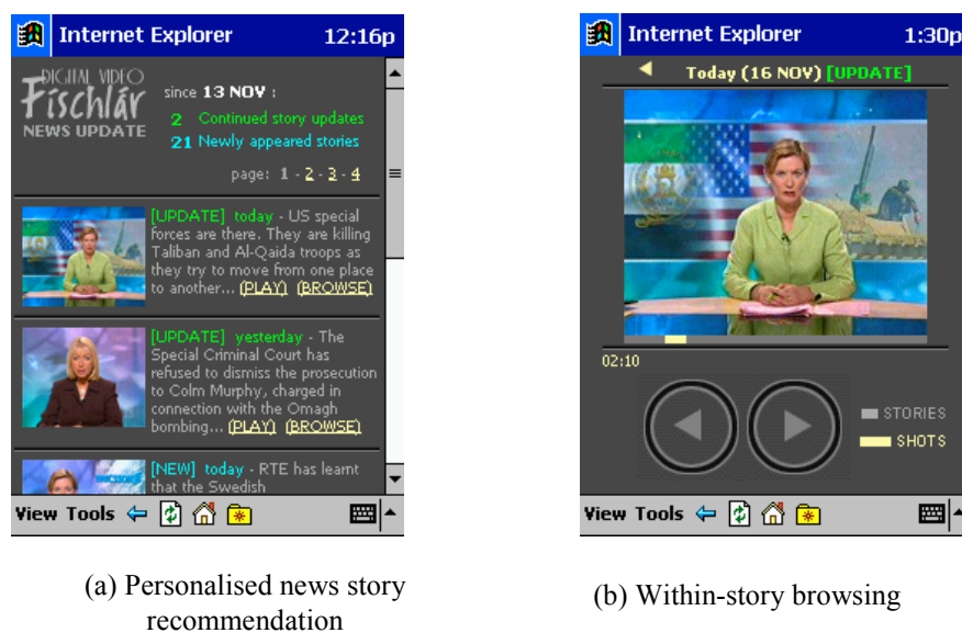
Figure 7.1: mFíschlár-News for a PDA

If we follow these guidelines when developing a video information retrieval system then this leads us to a completely different kind of video IR system than one developed for access to the same material from a desktop environment. One example of this is the interface developed for the Físchlár system mentioned earlier, which runs on a mobile platform and is used for accessing an archive of broadcast TV news. The system is known as mFíschlár (Lee and Smeaton, 2002a) and runs on a Compaq iPAQ using a wireless LAN and some screens taken from the system are shown in Figure 7.1. Here we can see, in (a), a personalised summary of the TV news with 9 news stories recommended for the user's attention, 8 of which are new and 1 of which is an update on a news story that this user is already aware of. Figure 7.1(b) shows the user flicking through the keyframes generated for a particular news story using the -> and <- (right arrow and left arrow) buttons, and by simply tapping on a keyframe, streaming of the video to the mobile device will commence from that point in the video. mFíschlár is a somewhat contrived system in that a PDA with a wireless LAN card is not a streamlined user-friendly product such as the modern GPRS and 3G enabled mobile handhelds such as the XDA, but as a demonstrator it is a good illustration of what is possible on mobile platforms.