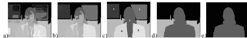
Figure 1. Structure analysis using symmetry, compactness, regularity and inclusion: a) initial partition (57 regions), b) 24 regions, c) 8 regions, d) 3 regions e) 2 regions.

An example is shown in Figure 1. The proposed features have been analyzed over the initial partition. A merging algorithm progressively structures the regions into sets of quasi-symmetric or partially included regions until the final partition. Observe, how inclusion allows the merging of regions 1 and 2 into the background in Figure 1.d). Partial symmetry with respect to a central element allows the merging of regions 4 and 5 with 3 (the central element). Texture information and transition strength between regions is also considered at each merging. This explains why the last two lower regions are merged within the background, and not with the central element (former regions 3+4+5) what might happen if only symmetry was considered.